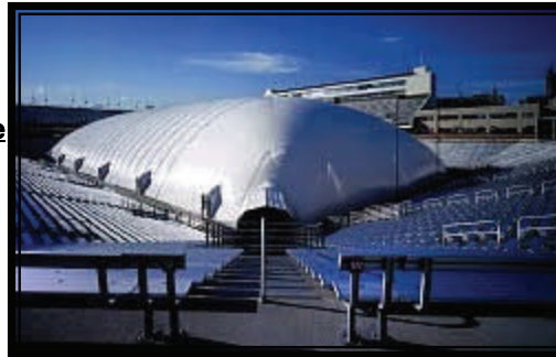
Bubble at Boston College