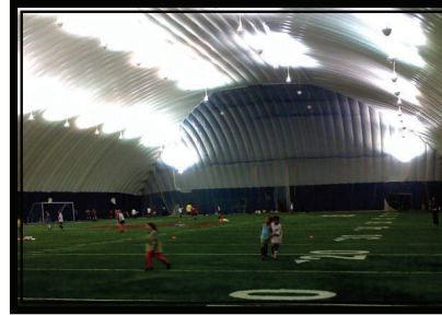
Fun and Development in the Bubble at Boston College